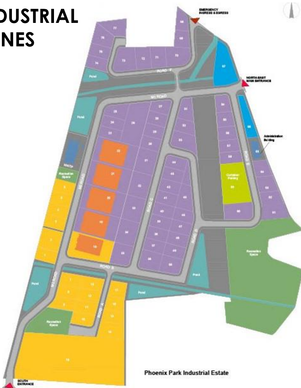
Phoenix Park Industrial Estate